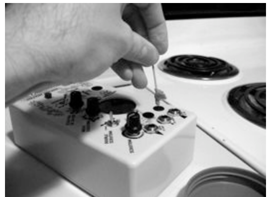
Figure 3: Applying to CV Input

So let's tidy ourselves up mentally, and dig into the functional pinkmeats of this jaundiced morsel