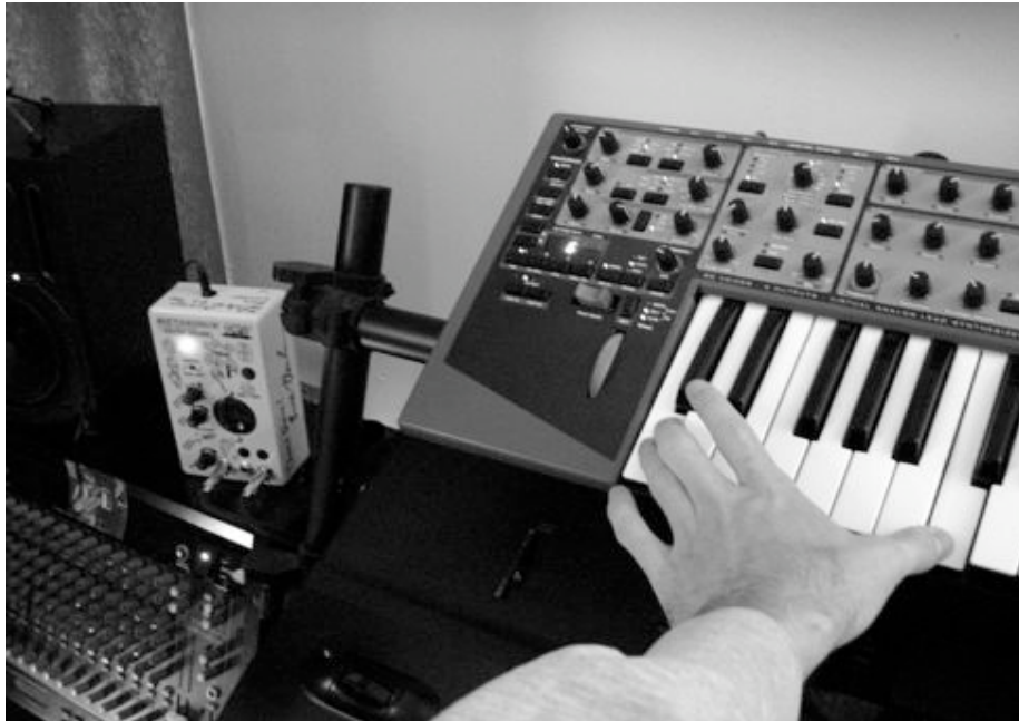
Figure 4: Using a red keyboard in a black and white image

Playing a tone will now produce a robust, quaint little distorted process. Adjusting the " Mega Scrotum " knob will turn the volume up and down. Bet you didn't think this manual would actually have any useful information in it, now did you? God damn you and your doubting heart.