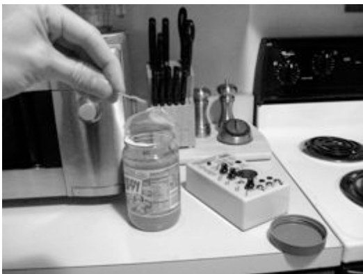
Figure 2: Peanut butter measuring

I have noticed that by applying peanut butter (see figure 2) to the interior of the pedal via the CV Input (see figure 3), that I was able to communicate with my dead grandfather about the whereabouts of his porno zoetrope collection. Afterwards, licking the peanut back out was very rewarding. Please note that this might void your warranty, assuming Mr. Barbour laughably even provided one.