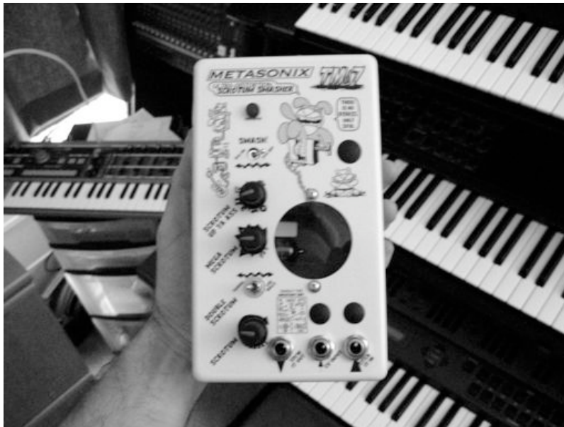
(image blurred to recreate realistic drunken euphoric effect on the cradler)

How to connect devices and whatnot to your pedal, and begin the journey that will color your soul a sort of brownish-grey forever and ever: plug your keyboard, guitar, electric zither, 8-track player, or other sound source into where it says " Stick It In. " Connect your mixer or sound recording device to where it says " Spew It Out. " Don't talk to the nice man in the van, even though the candy looks perfectly safe.