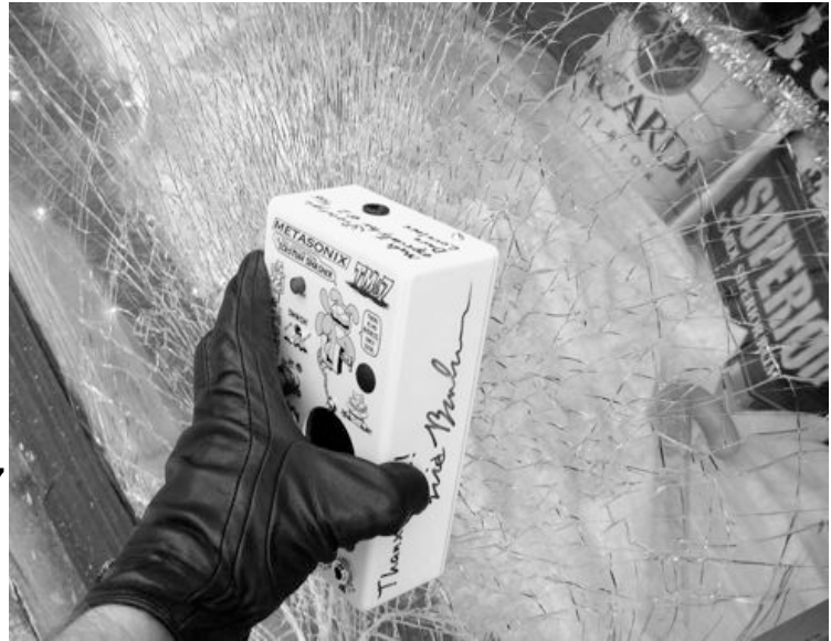
Figure 5: Be sure to wear black gloves for safety's sake

As you can probably already guess, getting off your ass, out of the studio, and proceeding forth squintingly into the outside world armed with your trusty TM-7 at hand, you can "signal process" the perception of yourself to others. You can also score some sweet holiday scratch from the coffers of liquor store proprietors,